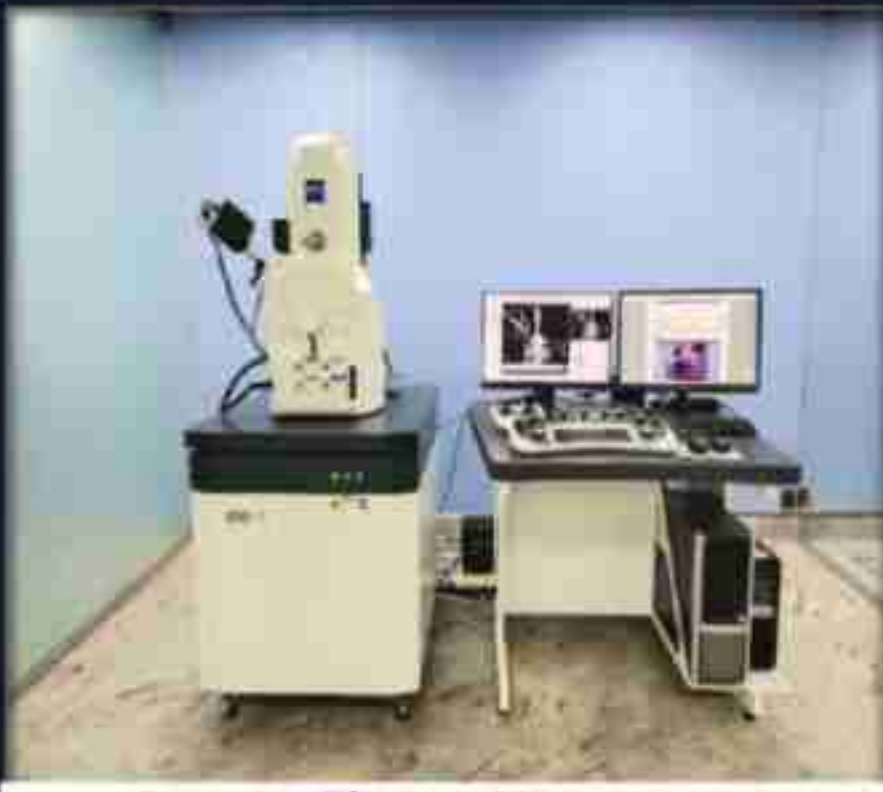
Scanning Electron Microscope

Scanning Electron Microscope (ZEISS EVO 18-Germany) is one of the most powerful instruments to study the surface topography of a material. This instrument can be used to observe the microstructure of materials. The microscope is operated under vacuum to a level of 10^{-6} torr. The instrument is capable of observing a microstructure at a magnifying power of 10 lakhs and also has a resolving power of 3-8 nm at an accelerating voltage of 30 kV. Because of the higher depth of focus, the microscope is able to characterize the fracture surface easily. The SEM is interfaced with the EDX system which is able to find out the chemical composition of the microconstitution qualitatively and quantitatively by spot analysis.