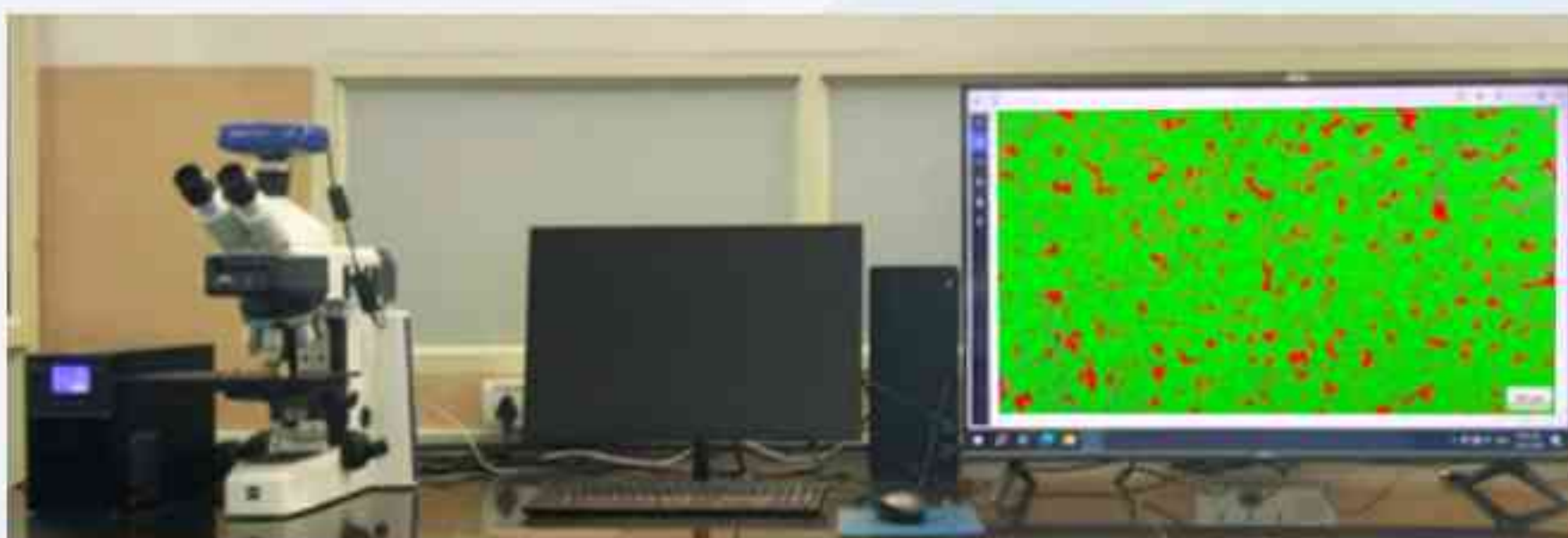
High Resulation Optical Microscop, Make: Carl-Zeiss