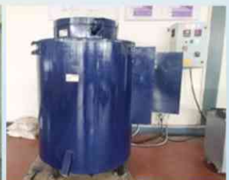
Salt Bath Furnace 1200°C